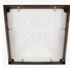
Tamper Proof Seat Protector

Cross-bar underframe; optional concealed floor mounting available.