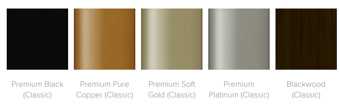
Table Leg Finish