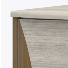
Waterfall Edging on Top

The kit and instructions for wall mounting are included with this product. The wall mount instructions provided must be followed carefully for a secure, durable, and long-lasting solution to ensure the safety of the unit and the user.