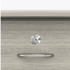
Optional Top Drawer Lock

Choose from dozens of hardware styles, including ADA compliant options.