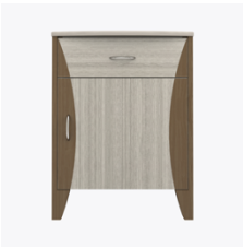
Other Bedside Styles

A top drawer lock is available and is optional.