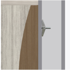
Wall Mount Hardware

Kwalu’s proprietary finish doesn’t have any of the drawbacks of wood. The finish is moisture impervious, easy to clean and maintenance-free.