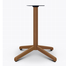
Compatible Table Bases

Choose from a number of edging options including OG, Beveled, Bullnose, Waterfall and Elliptical.