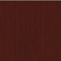
African Mahogany (Fusion)