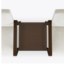
Optional Kwalu Top

Available with a 1.25" Top made of Kwalu's proprietary material.