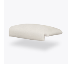
Seat Cushion is Field Replaceable

Cleanout prevents buildup of debris and provides for easy maintenance.