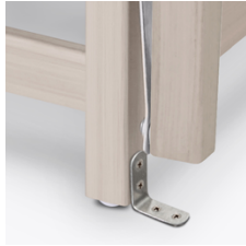
Optional Floor Mounting

Please contact a sales associate to purchase additional or replacement cushions.