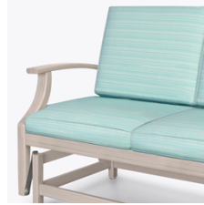
Optional Piping on Back Pillow and Seat

Kwalu's quick drying cushion construction moves moisture through fast allowing cushions and pillows to dry rapidly.