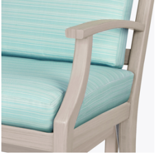
Waterproof Outdoor UV Protected Frame

Special additive protects frame against the elements and damaging ultraviolet rays.