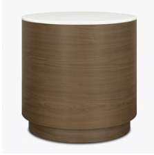
Corian®/ Hanex®/ Krion® Top

Kwalu's proprietary finish doesn't have any of the drawbacks of wood. The finish is moisture impervious, easy to clean and maintenance-free.