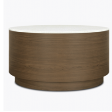
Other Table Styles

Corian®/ Hanex®/ Krion® tops, .5" waterfall edged, are available on all tables in the collection.