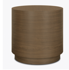
Optional Kwalu Top

The collection includes the straight drum design on both the coffee and end table styles.