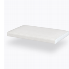
Seat Cushion is Field Replaceable

Caterina bariatric chairs are rated to 500 lbs weight capacity.