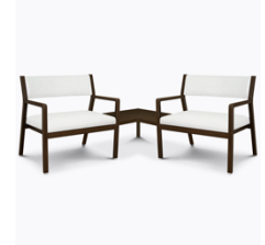
Optional Linking Tables

The seat cushion can be replaced in the field.