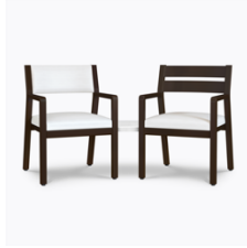
Other Table Styles

The linking table is available in a curved shape to better fit a curved space and is optional.