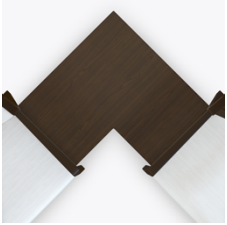
Optional Kwalu Top

Available with a 1.5" Top made of Kwalu's proprietary material.