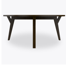
Other Table Styles

Kwalu's proprietary finish doesn't have any of the drawbacks of wood. The finish is moisture impervious, easy to clean and maintenance-free.