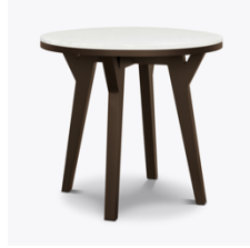
Optional Corian®/ Hanex®/ Krion® Top

Collection includes coffee and end tables.