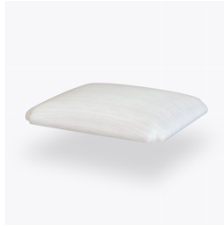
Seat Cushion is Field Replaceable

Our patented steel-reinforced joint system uses over 20 pieces of steel in most Kwalu chairs. Stop ongoing and costly furniture replacement.