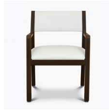
Optional Back Style

The seat cushion can be replaced in the field.