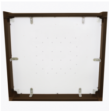
Tamper Proof Seat Protector

Our patented steel-reinforced joint system uses over 20 pieces of steel in most Kwalu chairs. Stop ongoing and costly furniture replacement.