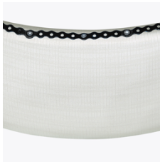
Tamper Proof Staple Cover

Laminate seat bottom with ventilation but no access to internal building materials and loose fabric; no visible staples, tamper-proof screws and brackets.