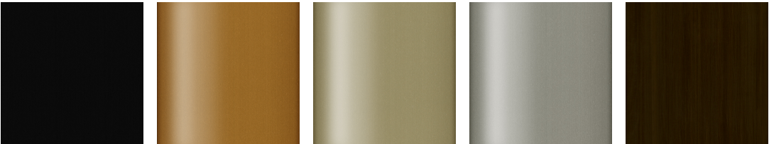
Premium Black (Classic) Premium Pure Copper (Classic) Premium Soft Gold (Classic) Premium Platinum (Classic) Blackwood (Classic)