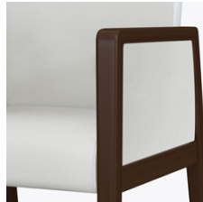
Optional Closed Arm Panels

The seat cushion can be replaced in the field.