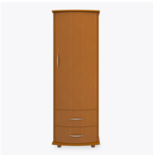
Other Wardrobe Styles

Standard clothing rod may be attached at ADA height of 48” from the floor.