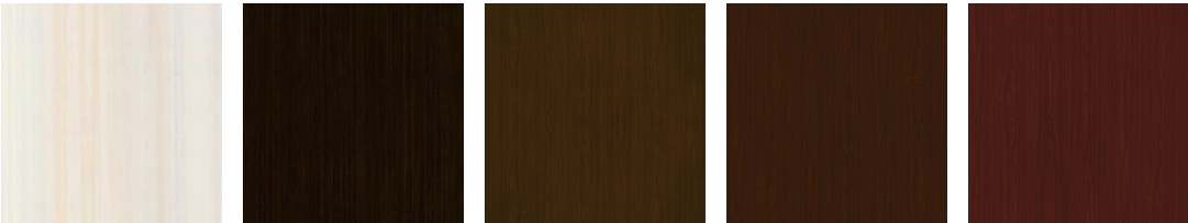
Wood Ash (Fusion)