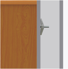
Wall Mount Hardware

Kwalu’s proprietary finish doesn’t have any of the drawbacks of wood. The finish is moisture impervious, easy to clean and maintenance-free.