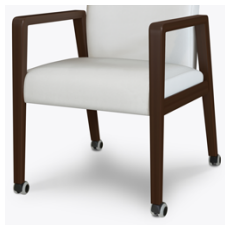
Brake Under Load Casters

Available with or without upholstered arm panels.