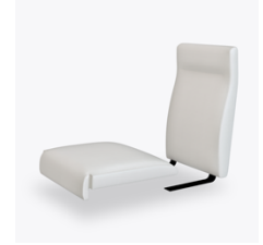
Back Cushion and Seat Cushion are Field Replaceable

Cleanout prevents buildup of debris and provides for easy maintenance.