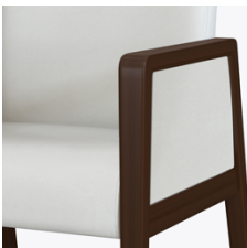
Optional Closed Arm Panels

Both the back cushion and the seat cushion can be replaced in the field.