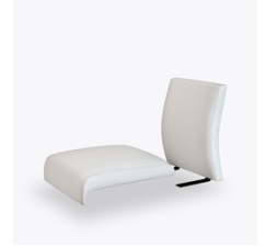
Back Cushion and Seat Cushion are Field Replaceable

Cleanout prevents buildup of debris and provides for easy maintenance.