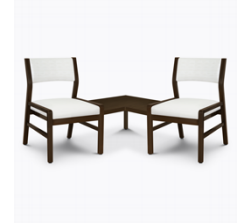
Optional Linking Tables

The seat cushion can be replaced in the field.