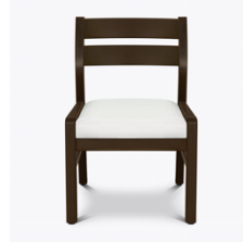
Optional Back Style

Wallsaver back legs help keep walls in pristine condition.