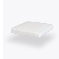
Seat Cushion is Field Replaceable

Choose from 2 optional back styles – Slat Back or Upholstered Back.