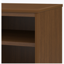
Bullnose Edging Finish

Kwalu's proprietary finish doesn't have any of the drawbacks of wood. The finish is moisture impervious, easy to clean and maintenance-free.