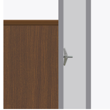
Wall Mount Hardware

For safety, 3/8" bullnose shape edge banding can be found on top and front side edges.