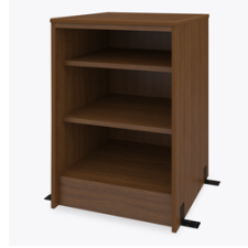
Optional Floor Mount

A standard feature with 2 toggle bolts provided for mounting on sheet rock wall; for concrete walls the customer provides the proper mounting hardware.