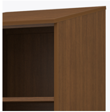
Bullnose Edging Finish

Kwalu's proprietary finish doesn't have any of the drawbacks of wood. The finish is moisture impervious, easy to clean and maintenance-free.