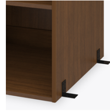
Optional Floor Mount

A standard feature with 2 toggle bolts provided for mounting on sheet rock wall; for concrete walls the customer provides the proper mounting hardware.