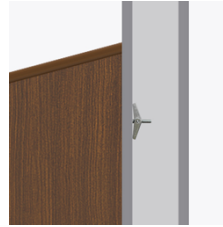
Wall Mount Hardware

A standard feature with 2 toggle bolts provided for mounting on sheet rock wall; for concrete walls the customer provides the proper mounting hardware.