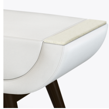
Optional Corian®/Hanex®/Krion® Arm Caps

Our patented steel-reinforced joint system uses over 20 pieces of steel in most Kwalu chairs. Stop ongoing and costly furniture replacement.