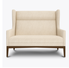
Number of Seats

Concealed cleanout eliminates a debris build-up behind the seat cushion.