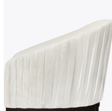
Optional Fabric Pleating Detail

Our patented steel-reinforced joint system uses over 20 pieces of steel in most Kwalu chairs. Stop ongoing and costly furniture replacement.