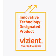
Vizient® Innovative Technology

Concealed cleanout eliminates a debris build-up behind the seat cushion.