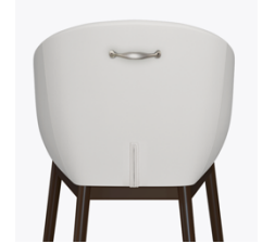
Optional Back Handle

Optional casters available on front legs only with side stretchers. If this option is selected, the legs will be thicker for additional support.