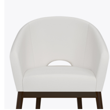
Optional Cutout on Back

Concealed cleanout eliminates a debris build-up behind the seat cushion.