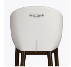
Optional Back Handle

An optional cutout on back is available to prevent buildup of debris and provide for easy maintenance.