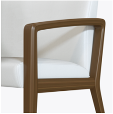
Faceted-Edge Frame Detailing

The outside face of the chair frame showcases faceted-edge detailing reminiscent of hand-crafted wood workmanship.