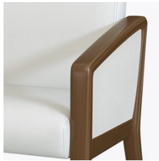
Optional Closed Arm Panels

Both the back cushion and the seat cushion can be replaced in the field.