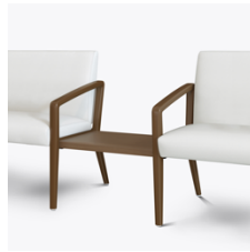
Optional Linking Tables

Available with or without upholstered arm panels.