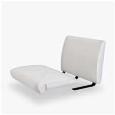
Back Cushion and Seat Cushion are Field Replaceable

Cleanout is incorporated behind the seat cushion to prevent buildup of debris while providing a clean look.