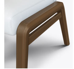
Faceted-Edged Frame Detailing

Cleanout is incorporated behind the seat cushion to prevent buildup of debris while providing a clean look.