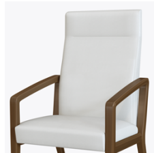
Optional Tall Back Cushion

Available with or without upholstered arm panels.