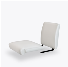
Back Cushion and Seat Cushion are Field Replaceable

Cleanout is incorporated behind the seat cushion to prevent buildup of debris while providing a clean look.