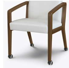
Brake Under Load Casters

Optional Center Linking tables are available to provide stationary space between the chairs and fit your space.