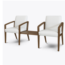
Optional Linking Tables

For increased comfort and support in waiting or reception areas, choose the optional tall back cushion.