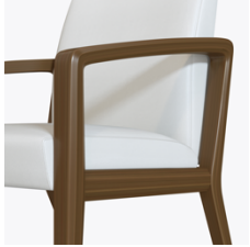
Faceted-Edged Frame Detailing

The outside face of the chair frame showcases faceted-edge detailing reminiscent of hand-crafted wood workmanship.