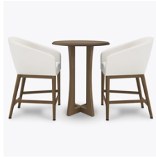
Coordinates with Counter Height Stools

Kwalu's proprietary finish doesn't have any of the drawbacks of wood. The finish is moisture impervious, easy to clean and maintenance-free.