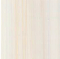
Wood Ash (Fusion)