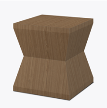
Optional Kwalu Top

Corian®/ Hanex®/ Krion® tops, .5" waterfall edged, are available.