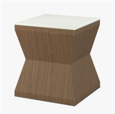
Corian®/ Hanex®/ Krion® Top

Kwalu's proprietary finish doesn't have any of the drawbacks of wood. The finish is moisture impervious, easy to clean and maintenance-free.