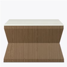
Other Table Styles

Available with a top made of Kwalu's proprietary material.