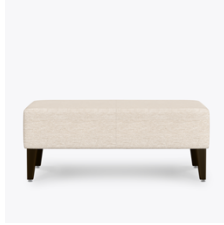
Optional without Exposed Seat Rail

Our patented steel-reinforced joint system uses over 20 pieces of steel in most Kwalu chairs. Stop ongoing and costly furniture replacement.