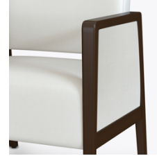
Optional Closed Arm Panels

Choose from 3 seat styles – lounge chair, love seat, and sofa.