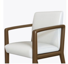
Faceted-Edged Frame Detailing

Cleanout is incorporated behind the seat cushion to prevent buildup of debris while providing a clean look.