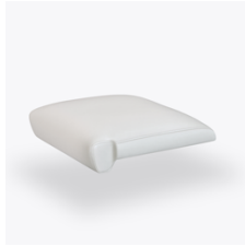
Seat Cushion is Field Replaceable

Kwalu's solid surface (1/8" thick) proprietary finish doesn't have any of the drawbacks of wood. The frames are moisture impervious, graffiti-resistant, easy to clean and maintenance-free.