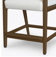
Easy to Use Footrest

Higher seat height designed to enable sitting without bending at the hip.