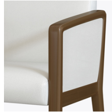
Optional Closed Arm Panels

The seat cushion can be replaced in the field.