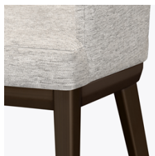
Contoured Seat Rails

Kwalu's solid surface (1/8" thick) proprietary finish doesn't have any of the drawbacks of wood. The frames are moisture impervious, graffiti-resistant, easy to clean and maintenance-free.