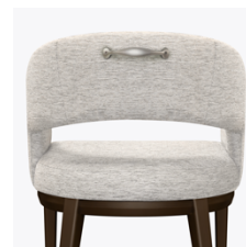
Optional Back Handle

Optional casters available on front legs only.