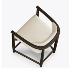
Curved Back Design

The seat cushion can be replaced in the field.