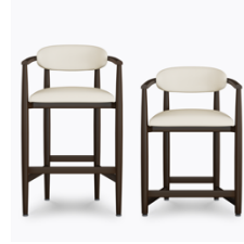
Bar and Counter Height

Our patented steel-reinforced joint system uses over 20 pieces of steel in most Kwalu chairs. Stop ongoing and costly furniture replacement.