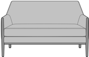
Bolsena Love Seat, without Piping Model: BSNA210LS 54.5W 29.75D 34H 25AH