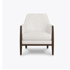
Number of Seats

Our patented steel-reinforced joint system uses over 20 pieces of steel in most Kwalu chairs. Stop ongoing and costly furniture replacement.